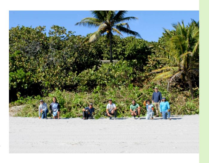
Volunteers pose in front of the pile of Scaevola taccada they removed.

For more photos from the event, <u>click</u> <u>here</u>.